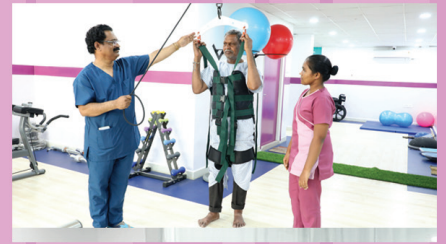
MOBILITY GAIT TRAINER