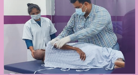
MOTORISED BOBATH TABLE