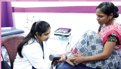
SHOCK WAVE THERAPY